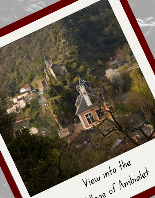
View into the Village of Ambialet