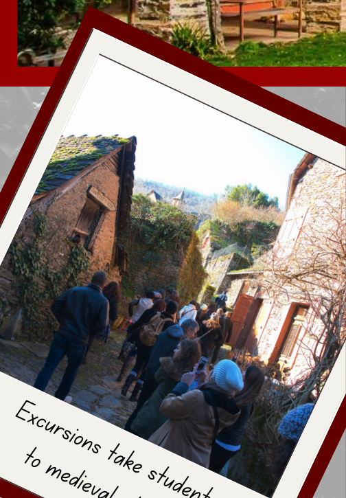
Excursions take students to medieval villages...