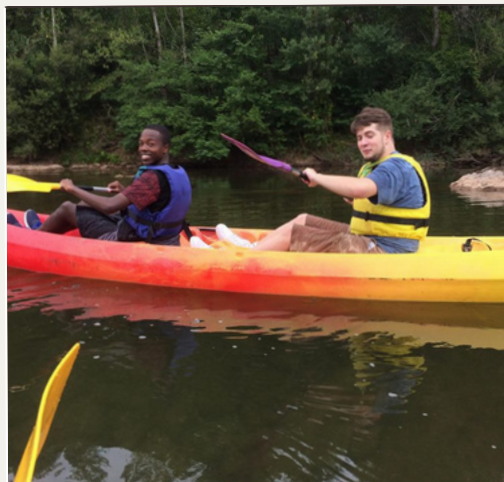
Activities, excursions, and hands-on learning in th ebeautiful surrounding region of Ambialet