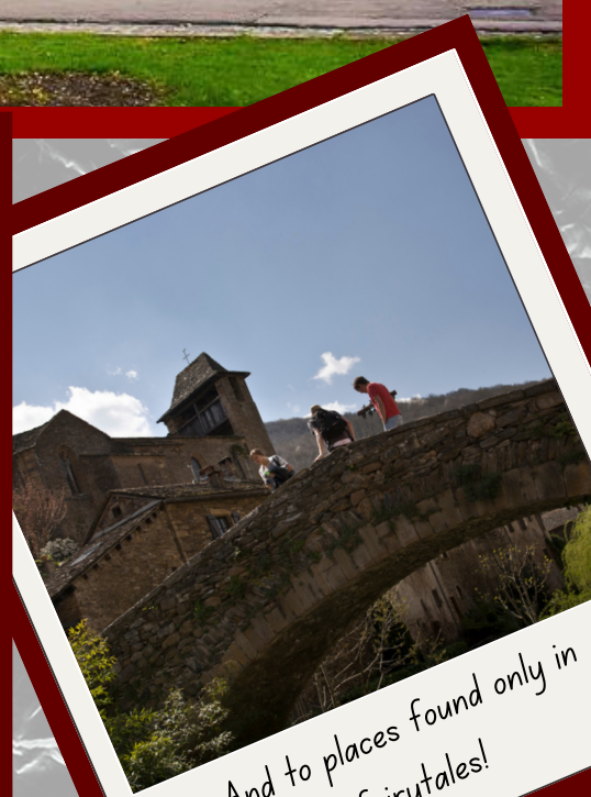
...And to places found only in fairytales!