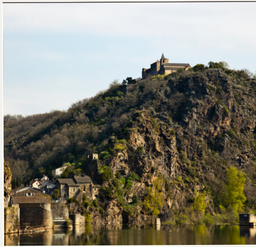
The villiage of Ambialet with Saint Francis University's site perched on the hilltop